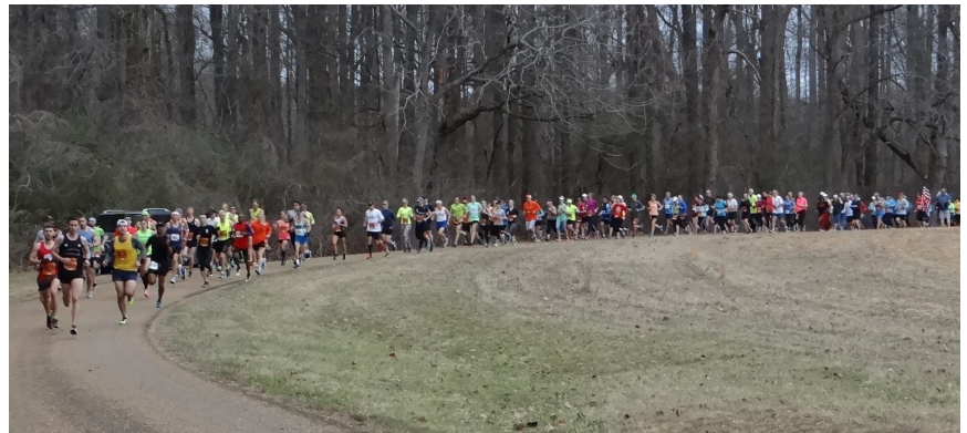
10-Mile Run for the Heart Start

On 10 February 2018, Council 5480 hosted over 180 runners for our 5 th Annual 10-Mile Run for the Heart. It was the biggest run to date. Volunteers from the Council, Cub Scout Pack 242, and Boy Scout Troop 242. We raised over 1000 dollars for the American Heart Association.